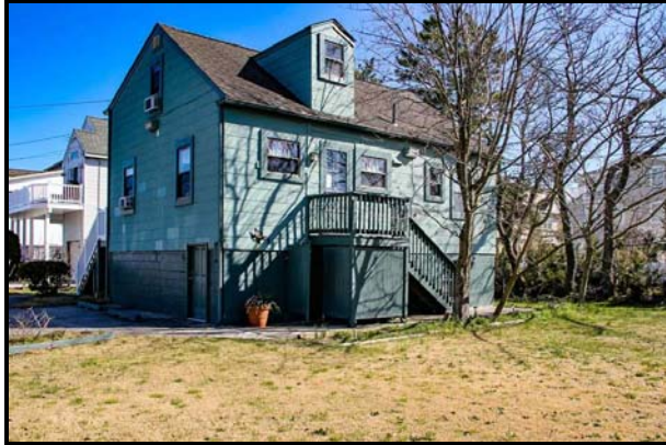
76 W 33 rd , Avalon, NJ 08202