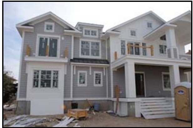
241 107 th Street, $2,895,000, UNDER CONTRACT MLS#: 170892