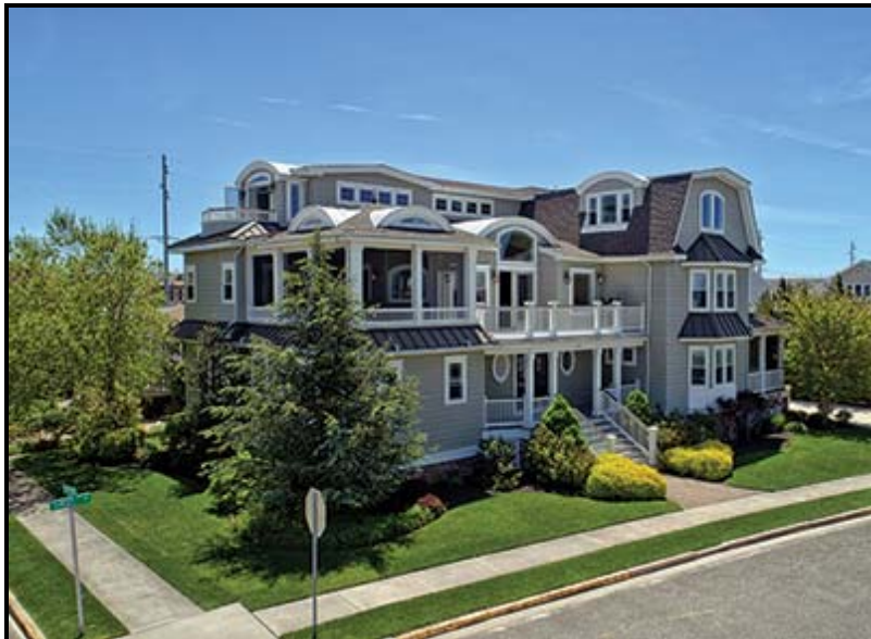
7429 Sunset Drive, Avalon, NJ 08202