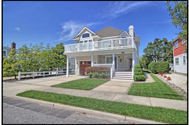
75 W 22 nd , Avalon, NJ 08202