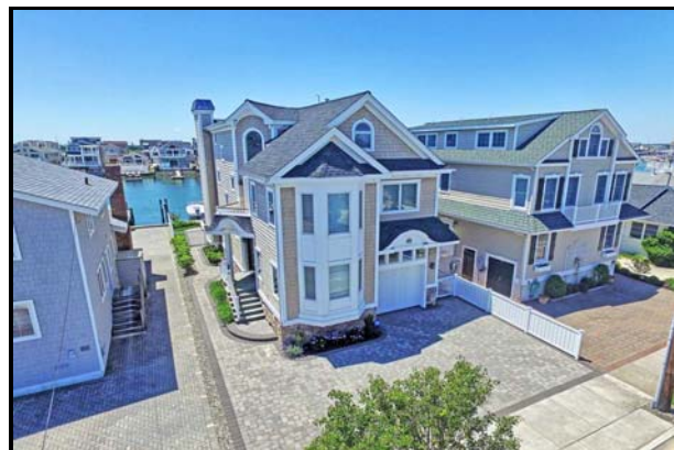
5748 Dune, Avalon, NJ 08202