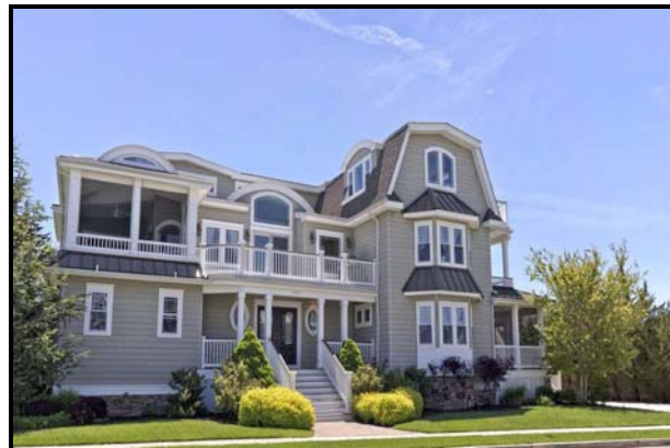
7429 Sunset, Avalon, NJ 08202