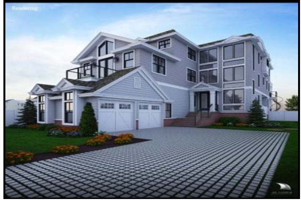
4838 Ocean Drive, $5,395,000, UNDER CONTRACT MLS#: 172016