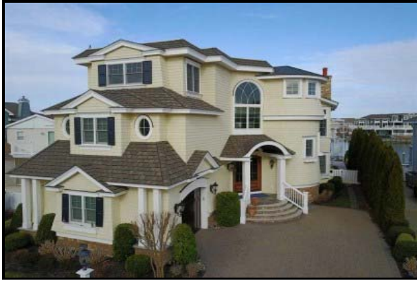
5410 Fifth Avenue, $4,750,000, SOLD MLS#: 174604