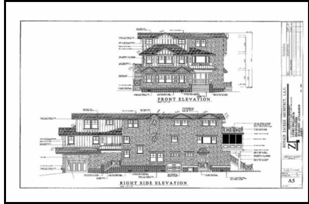
511 42 nd NJ 08202