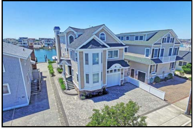
444 22 nd , Avalon, NJ 08202