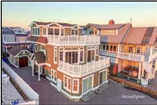
660 First Avenue, $2,910,000, SOLD MLS#: 174545