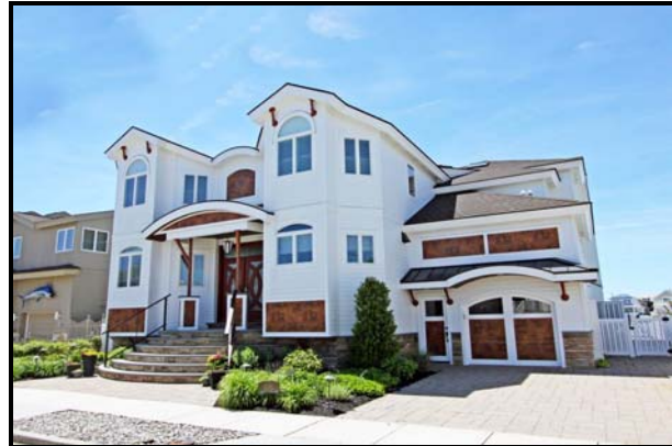
10109 Sunrise, Stone Harbor, NJ 08247