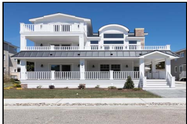
125 78 th , Avalon, NJ 08202