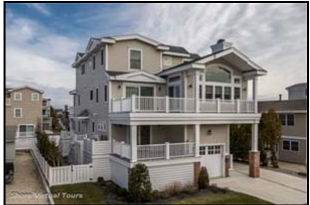
273 58 th Street, $2,995,000, UNDER CONTRACT MLS#: 174428