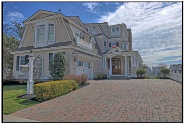
4603 Fifth Avenue, $3,495,000, UNDER CONTRACT MLS#: 175456