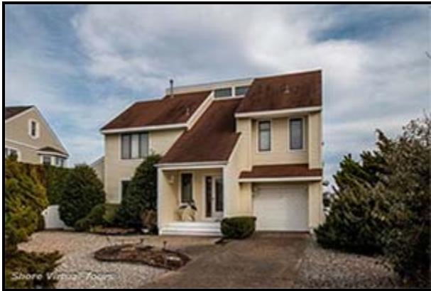
23 Heron Drive, $2,795,000, UNDER CONTRACT MLS#: 174078