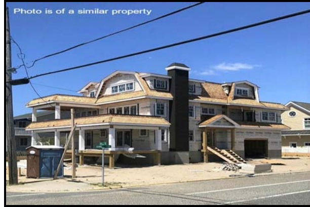
93 E 22 nd , Avalon, NJ 08202