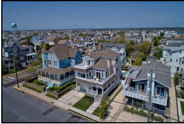
3268 First, Avalon, NJ 08202