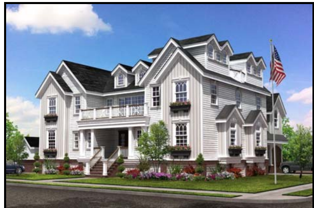
5088 Dune, Avalon, NJ 08202