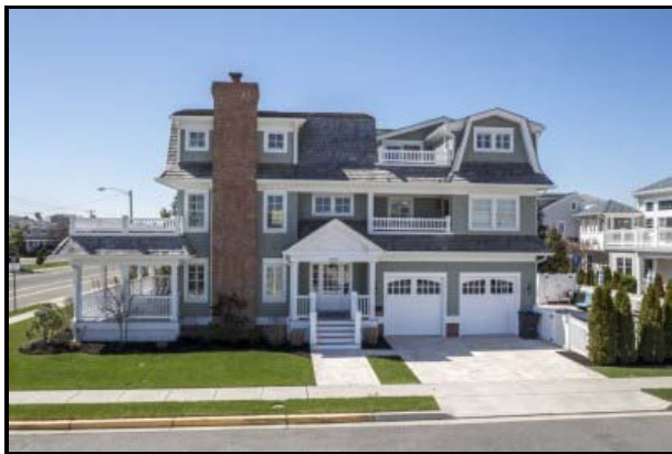
6718 Dune Drive, $3,310,000, SOLD MLS# 174559